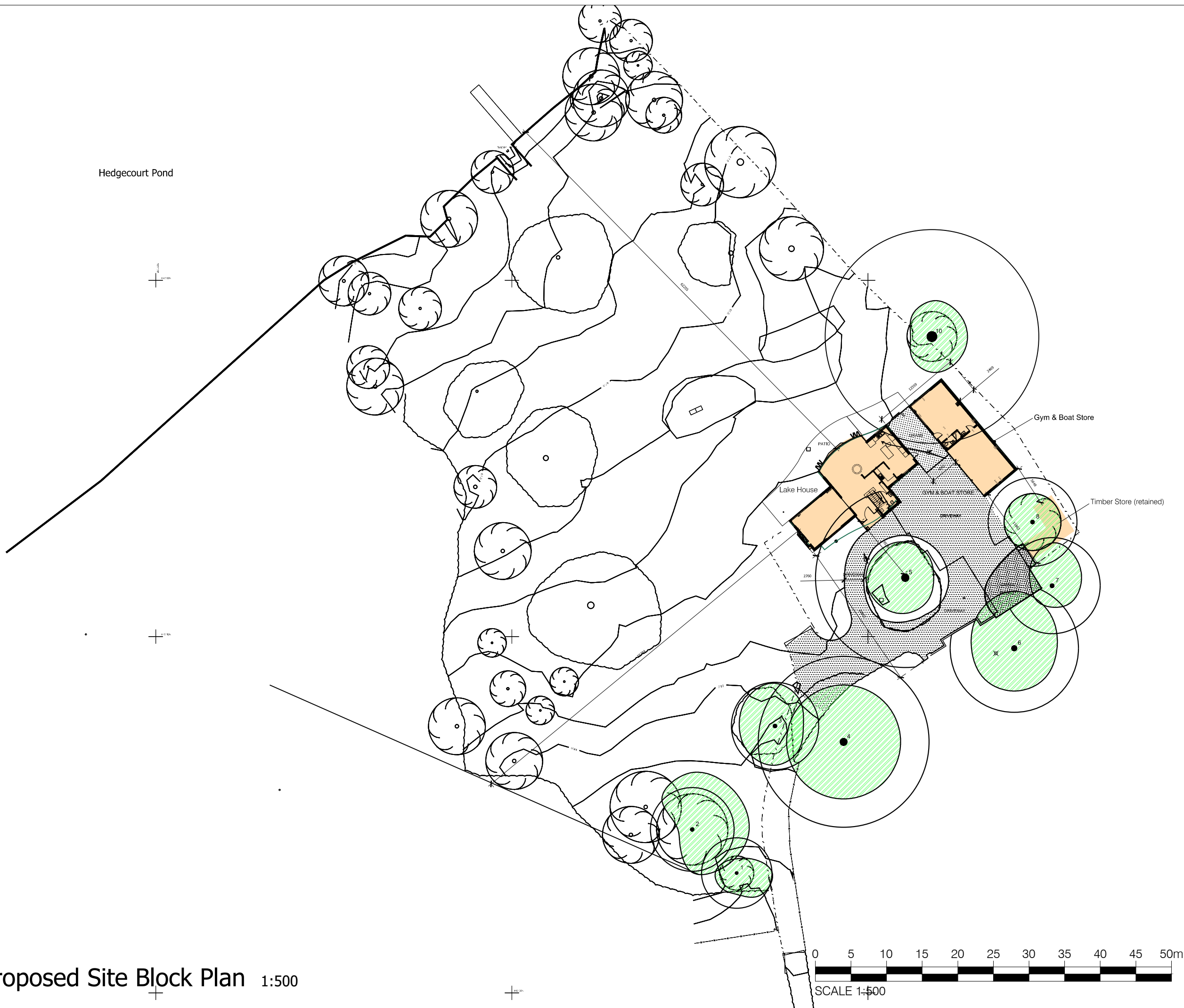
Proposed Site Block Plan 1:500