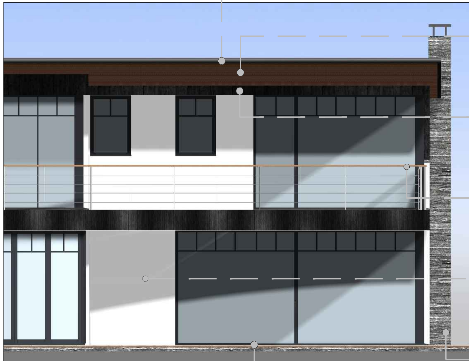
As Proposed Materials